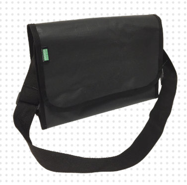
Messenger Banner Tote 15"x4"x11" Under 100 Unit Price: $30 Over 100 Unit Price: $25 Over 500 Unit Price: $20