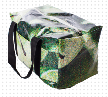
Banner Duffle Bag 20"x12"x12" Under 100 Unit Price: $35 Over 100 Unit Price: $32 Over 500 Unit Price: $30