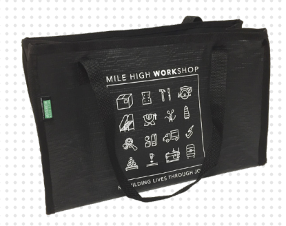
Medium Banner Tote 15"x5.5"x10" Under 100 Unit Price: $22 Over 100 Unit Price: $16 Over 500 Unit Price: $14