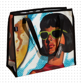
Large Banner Tote 15"x7"x15" Under 100 Unit Price: $25 Over 100 Unit Price: $19 Over 500 Unit Price: $16