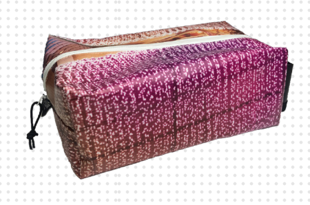
Banner Dopp Bag 10"x6"x4" Under 100 Unit Price: $18 Over 100 Unit Price: $15 Over 500 Unit Price: $12