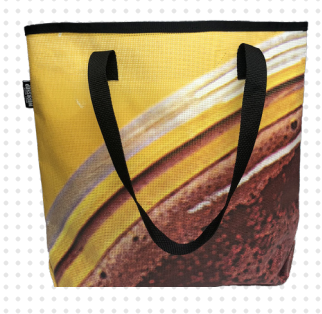
All Purpose Banner Tote 14"x4"x15" Under 100 Unit Price: $20 Over 100 Unit Price: $15 Over 500 Unit Price: $13.50