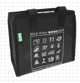
Small Banner Tote 9"x4"x8" Under 100 Unit Price: $19 Over 100 Unit Price: $14 Over 500 Unit Price: $12